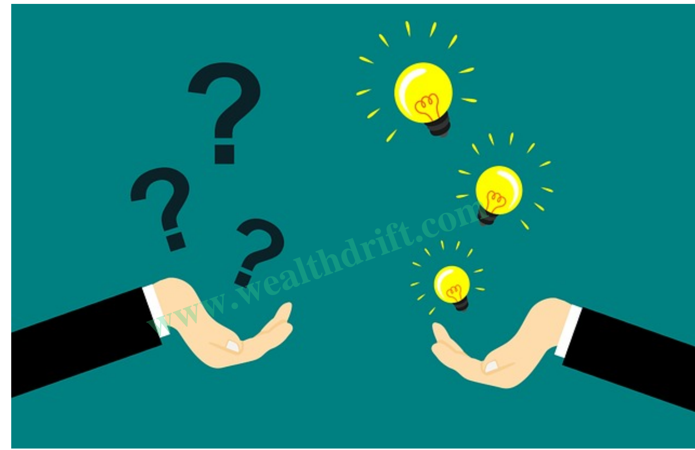
Know how to earn money online without investment in India