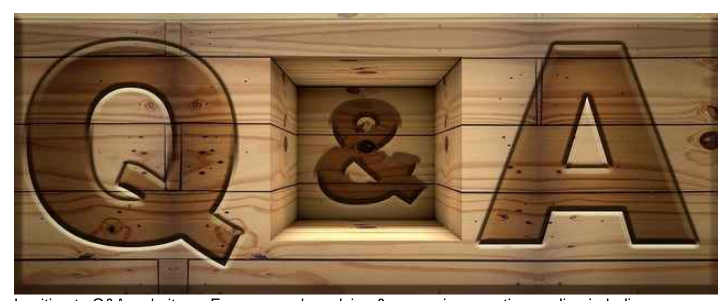
Legitimate Q&A websites - Earn money by solving & answering questions online in India

There is a worldwide common problem among many students that they too want some money to support their extra-curricular activities and entertainment during their school/college days. Because of this, many Indian students one way or another seek how students can earn money online at home in India, and that too without any investment. So, just give this article just 2-3 mins of your time and know these most important Q&A websites.